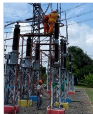
Figure 1. Maintenance of MTU Bay jepara 2

PT. ABC is engaged in transmission services which has the main function of managing distribution installation assets (transmission and substations) and maintaining installation assets to maintain the continuity of high-voltage electricity distribution efficiently, reliably and environmentally friendly. When carrying out routine 2-year maintenance work at PT. ABC, there is one worker who does not wear complete Personal Protective Equipment (PPE), during the process of checking the Lightning Arrester (LA) this is the cause of a work accident.